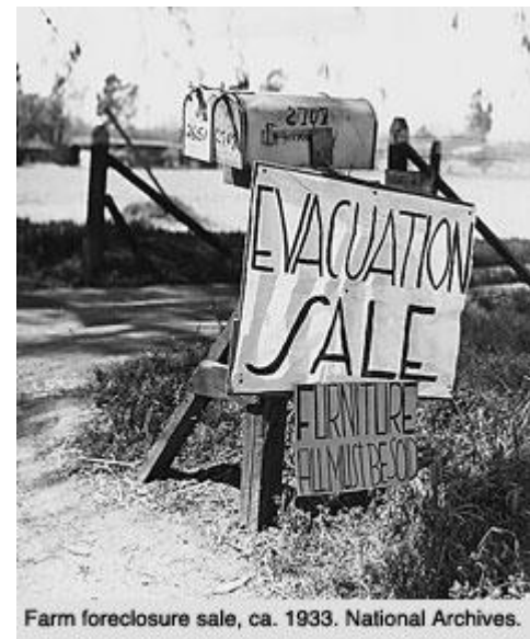
Farm foreclosure sale, ca. 1933.

In over a third of the cases multiple factors, such as health and finances, were present.